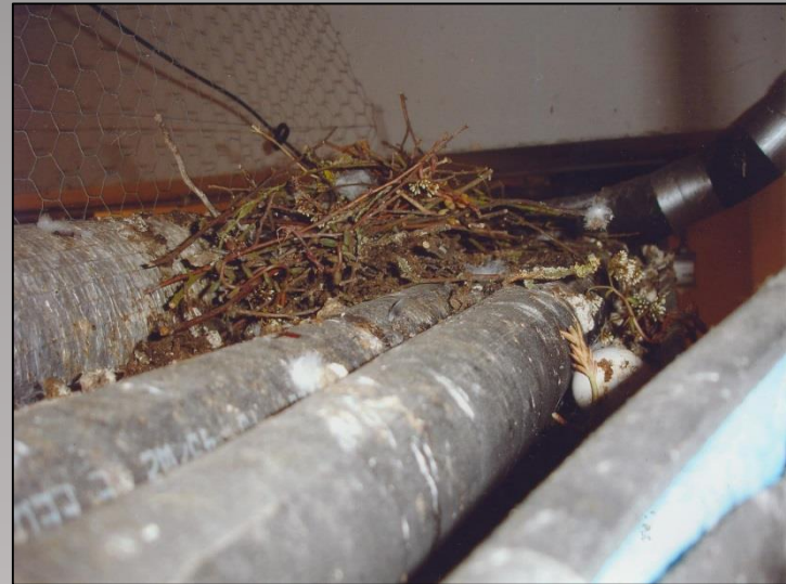
The cable trays above the car park of Dolphin Yard had become a nesting site for pigeons.